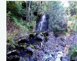
The Gleniffer Braes "The Midgees Dance Aboon The Burn"