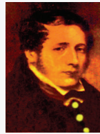
Portrait of Robert Tannahill Painted while he was resident in Bolton

These concerts have since been continued annually; in one instance for the erection of a monument to Robert Burns, and since that in aid of the funds of the Royal Alexandra Infirmary, Paisley.